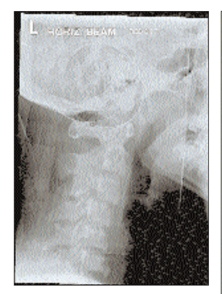
X-RAY: Asmat's broken neck.